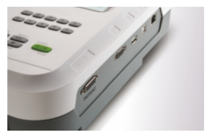
Memory of 300 patient records; USB memory storage; Network communication (RS232)