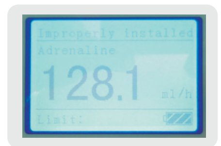
HD LCD Display