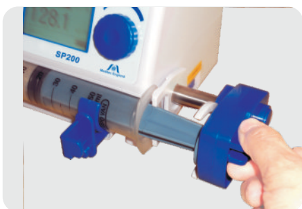
Single Hand Operation