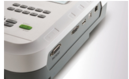
Memory of 300 patient records; USB memory storage; Network communication (RS232)