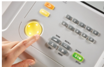
Alphanumeric keyboard; Individual function buttons