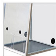
Three Side Glass Windows Back&Side glass windows maximize light and visibility, providing a bright and open working environment