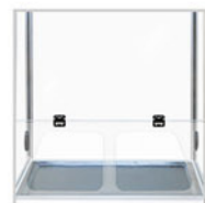
Folding acrylic front window, down part with free stop function