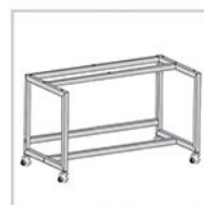
Base Stand Optional