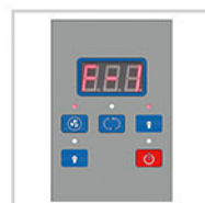
LED Display Digital LED display: Airflow Level